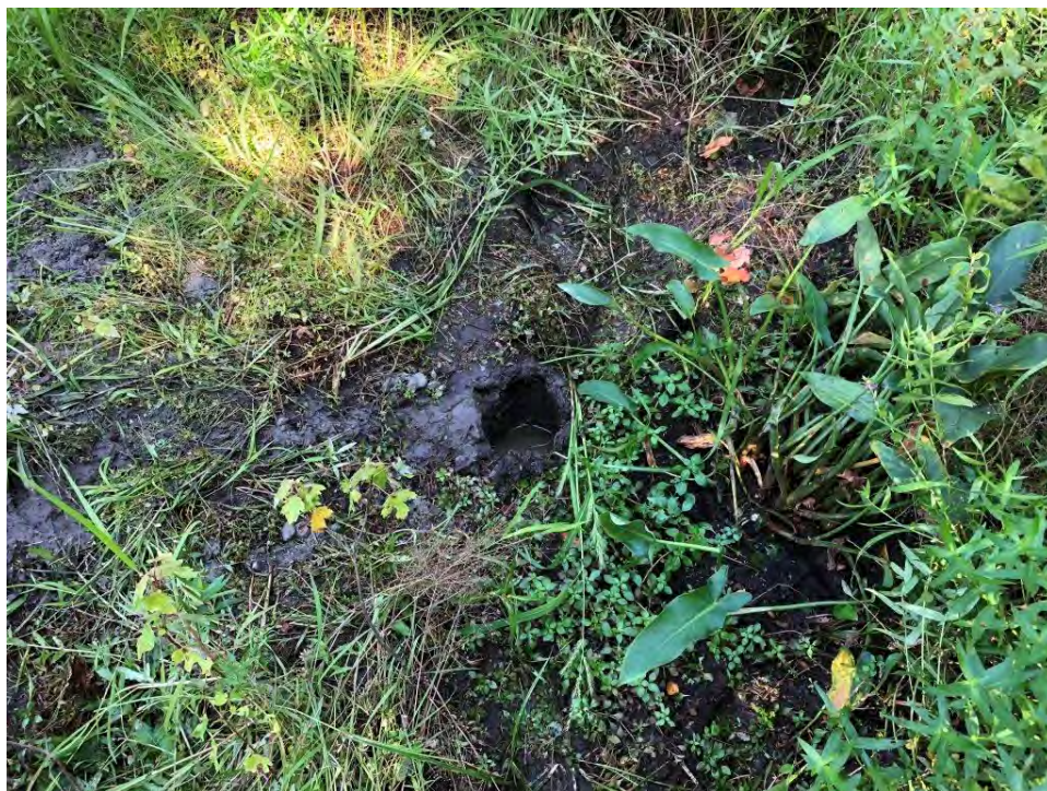
SCENE: Close-up of view of sediment sample location BCA-C1.