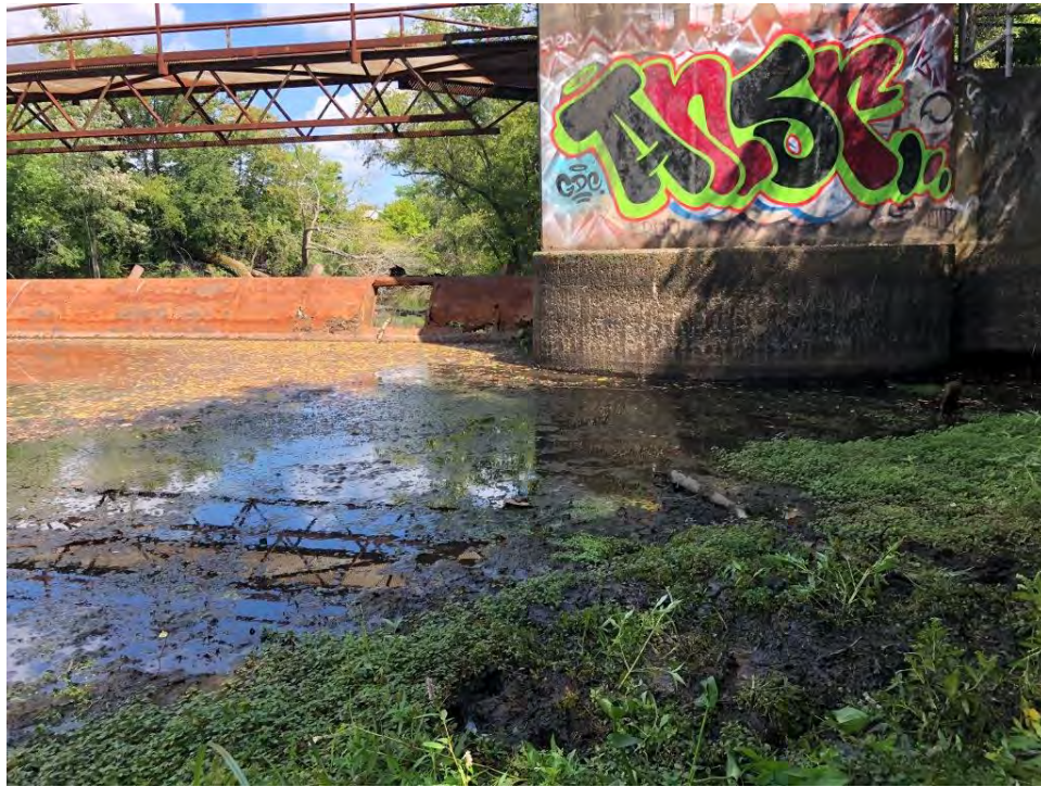
SCENE: View of sediment sample THD-C1 with the THD in the background. Photograph taken facing east.