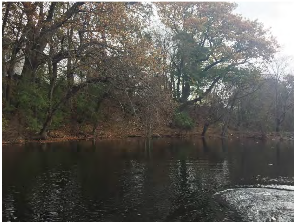
SCENE: View of sample location SD-33 located behind/upstream of the Centennial Dam on Mother Brook. Photograph taken facing northeast.