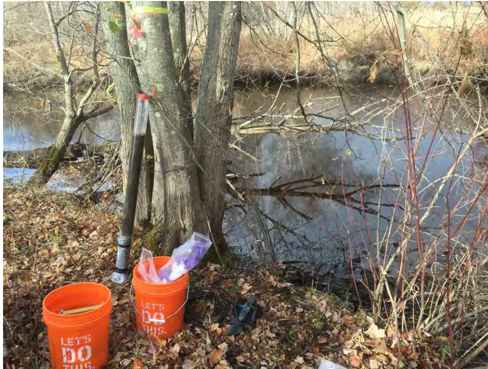
SCENE: View of sample location SD-25 located on the southeastern bank of the UNR. Photograph taken facing northwest.