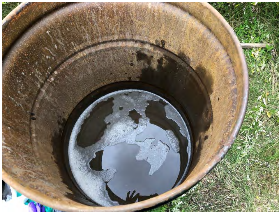
SCENE: View of aqueous IDW drum, staged at the former Lewis Chemical staging area.

DATE: 10 September 2018