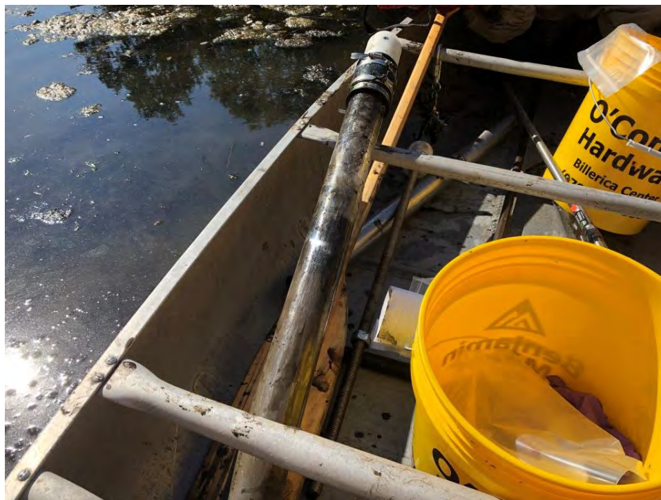
SCENE: View of a sediment core, WBD-C4, collected at the WBD Area.