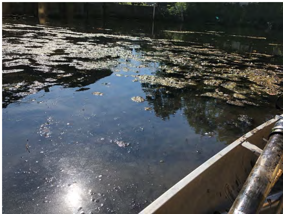
SCENE: View of the Neponset River at the Walter Baker Dam (WBD) area.