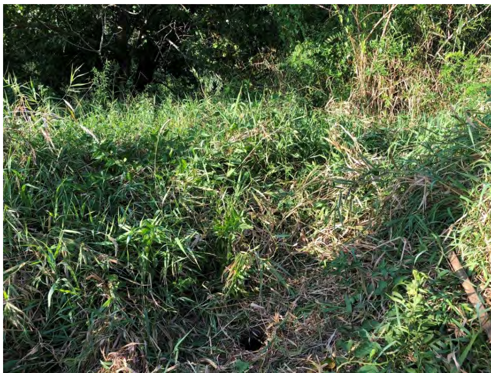
SCENE: View of sediment sample location BCA-C4. Photograph taken facing north.