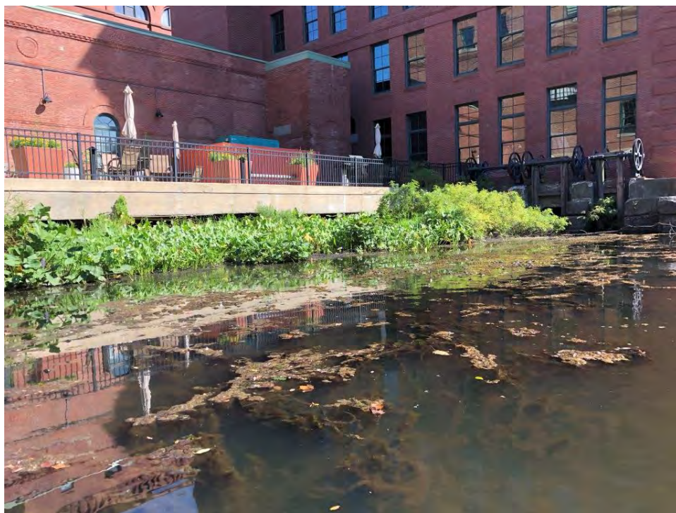
SCENE: View of sediment sample location WBD-C4. Photograph taken facing northwest.