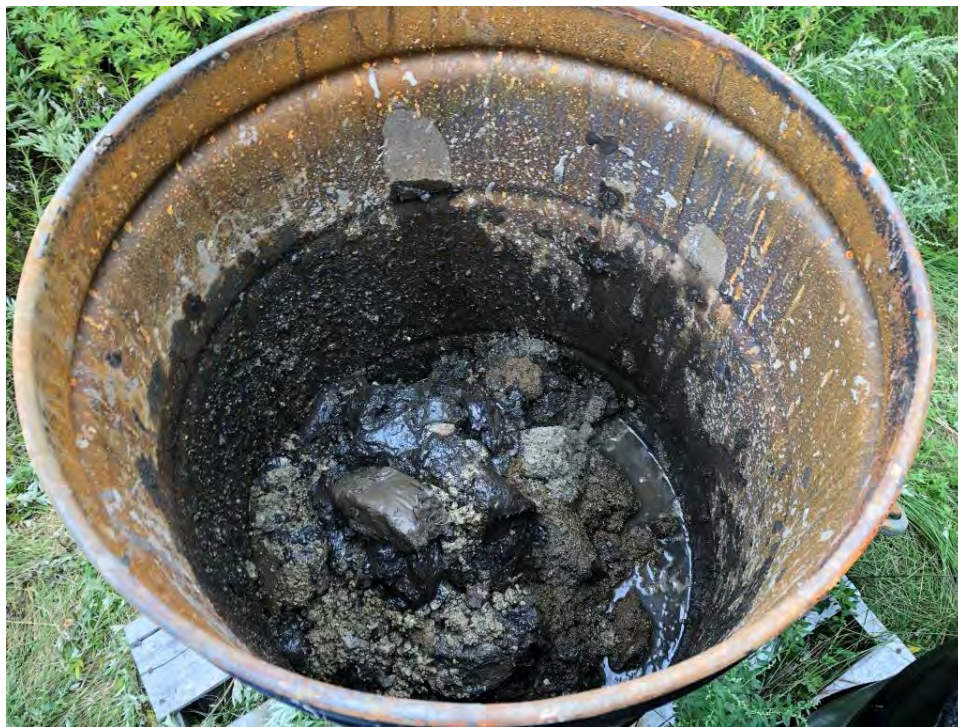
SCENE: View of solid investigation-derived waste (IDW) drum, staged at the former Lewis Chemical staging area.

DATE: 10 September 2018