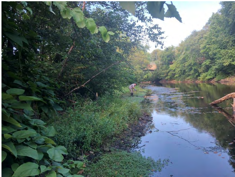
SCENE: View of sediment sample location LCA-C2. Photograph taken facing northeast.