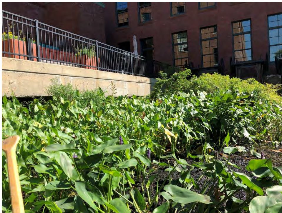
SCENE: View of sediment sample location WBD-C4. Photograph taken facing northeast.